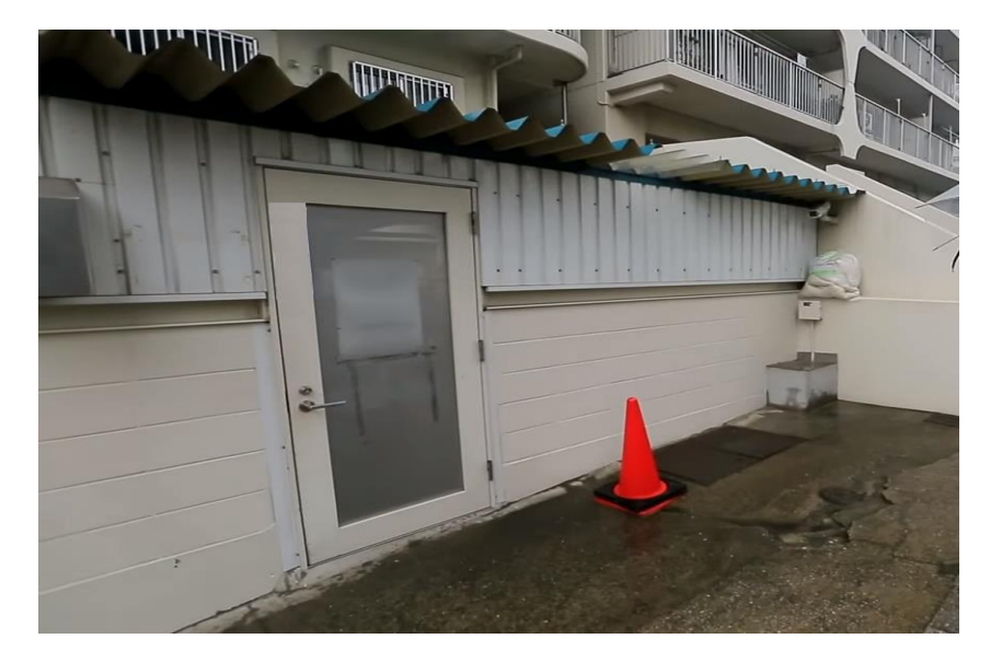
Fig. 3 - Facility for collection, sorting and temporary storage of MSW

In section A of facility organic waste for compost will be collected in containers. Food waste is collected in a paper bag which is thrown into brown bin. Composted waste undergoes further processing into nutrient-rich soils (biohumus).